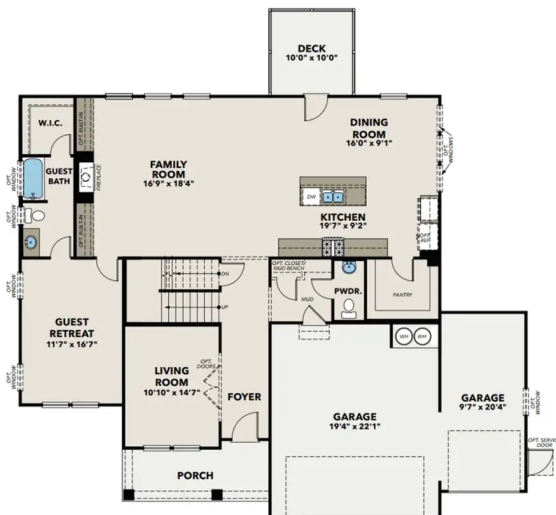
LASSITER HAMPTON FIRST FLOOR