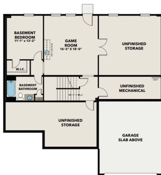
LASSITER HAMPTON FINISHED BASEMENT (REAR DAYLIGHT)