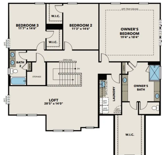
LASSITER HAMPTON SECOND FLOOR