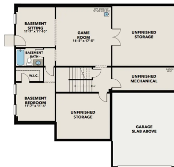
LASSITER HAMPTON FINISHED BASEMENT (SIDE DAYLIGHT)