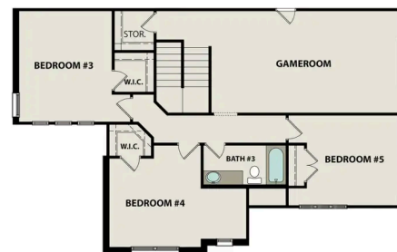
THE JENNINGS C - 3 CAR GARAGE UPPER FLOOR PLAN