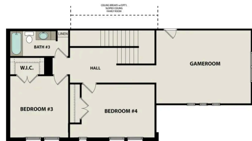
THE BELLAR C UPPER FLOOR PLAN