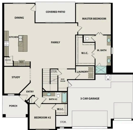
THE JENNINGS C - 3 CAR GARAGE MAIN FLOOR PLAN