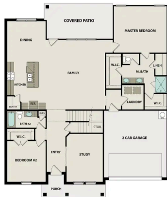
THE BELLAR C MAIN FLOOR PLAN