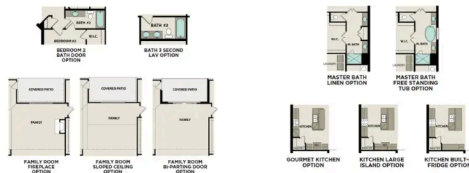
THE JENNINGS C - 3 CAR GARAGE MAIN FLOOR PLAN OPTIONS